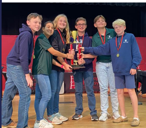
SJCS scored second place at Brain Brawl!

Let the children come to me, and do not prevent them, for the kingdom of heaven belongs to such as these.