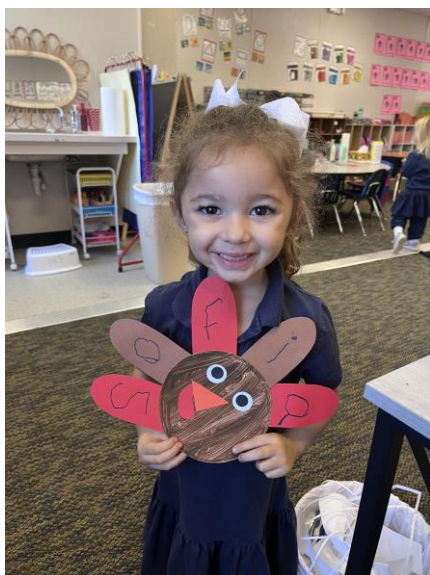
Turkey fun in Pre-K3!